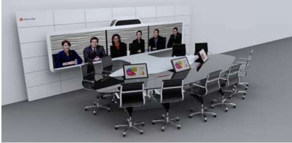
Figure 1.0 – content displayed during a video call