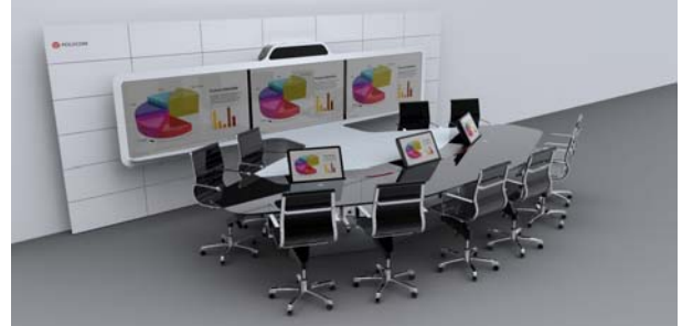
Figure 1.1 – content displayed off a call

On a call, content is displayed on the tabletop content monitors.